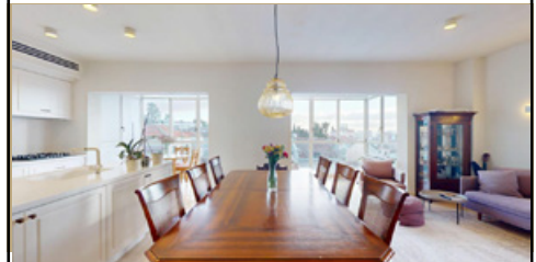
Renovated elegant apartment of 120 sqm, Rehavia/Shā'are Chesed, Sukkah balcony, 5 rooms, elevator, full of light