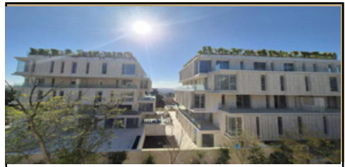
Unique & New apartment for rent, Dubnov 1, Talbieh, luxurious building, 270 sqm, 90 sqm terraces, high-end finishes, 2 parking spots, storage